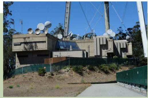
An artist's rendition of how vegetation and screening will look when the new plants mature, and the same perspective last summer (inset).